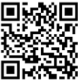
Join Our Contact List!