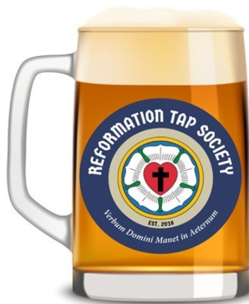
*ADULTS 18 AND OLDER

Theology and conversation with a bit of hops.