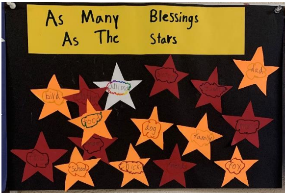
Learning About God's Promises

This is a question I often hear first thing in the morning as students arrive for another great day in second grade. But the answer is really not a simple one because in the course of the school day we are very busy with various lessons and projects. The best part of the day is often our morning devotion time. Second graders take turns reading these, and it is a time blessed with sharing God's love and truth with each other. They get so excited when it is their turn to lead our devotion. Then we have Bible story time, and the class really likes to learn more about their favorite Bible characters. Often, we complete a project that helps us remember our Bible stories or gives an opportunity to witness about our faith.