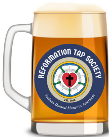
*ADULTS 18 AND OLDER

Theology and conversation with a bit of hops.