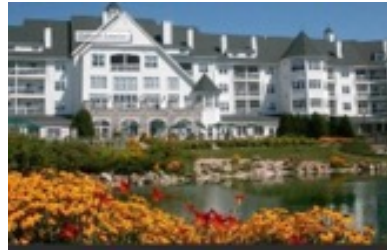
The Osthoff Resort 101 Osthoff Avenue Elkhart Lake, WI 53020-0151 (855) 876-3399